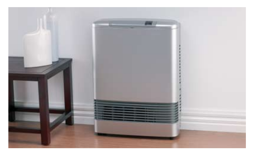
Energysaver 557FTR in Silver