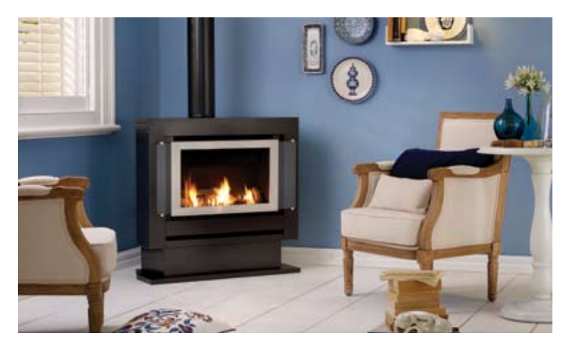
Sapphire Freestanding with Plinth

Console ( Floor Mounted ) Option – This freestanding design has a more contemporary feel with the unit simply resting on the same size base. Console Kit ordered separately.