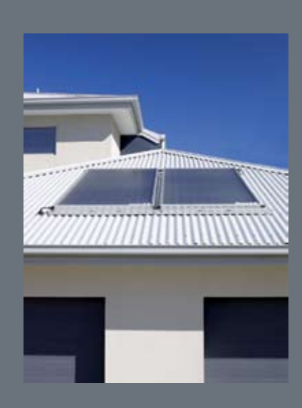
Gas Boosted Solar Hot Water