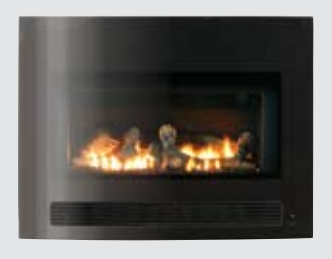
Curved Glass in Black