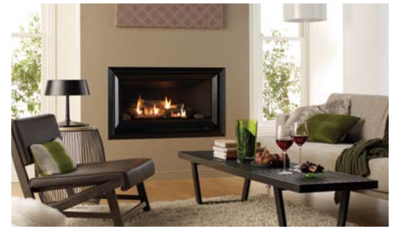
Symmetry in Black