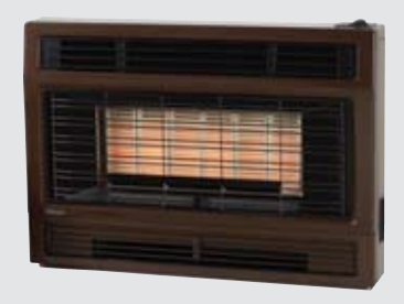
2001 in Brown