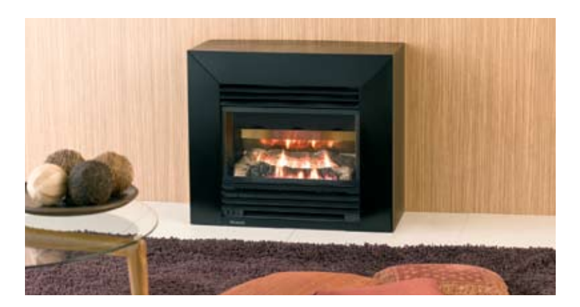
Slimfire Console Kit

Designed for convenience, the Slimfire console is ideal for situations where a false fireplace is not desired or where there is no masonry fireplace, providing flexibility and reduced installation costs. Purchased in addition to the Slimfire, the kit simply assembles around the fire allowing it to be installed against a wall.