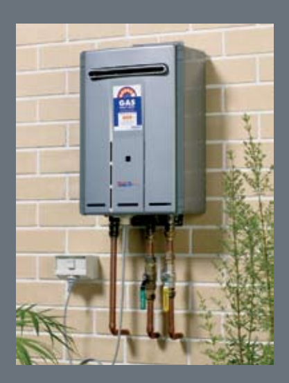
INFINITY 26Plus Continuous Flow Hot Water