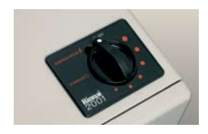
2001 Control Panel