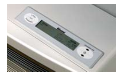
Ultima II Control Panel