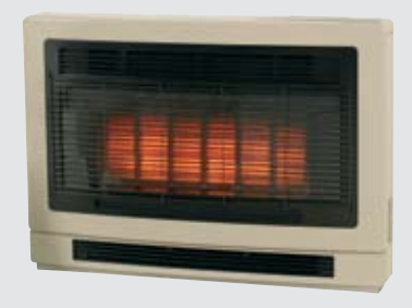
Ultima II in Beige