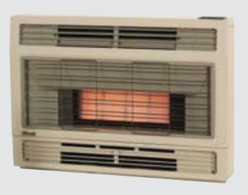
Spectrum in Beige