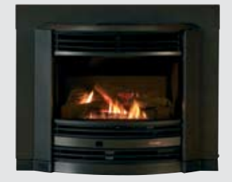
Inbuilt in Black