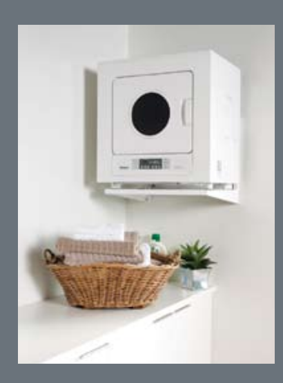
Gas Clothes Drye