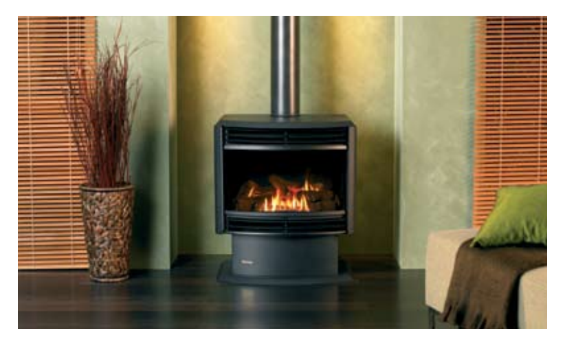
Royale Freestanding in Black