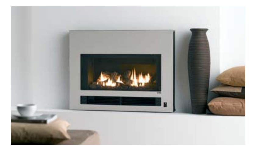
Aspiration in Stainless Steel